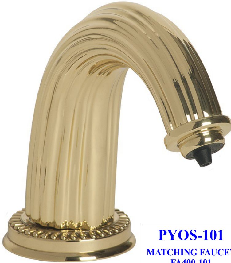
PYOS-101 MATCHING FAUCET FA400-101